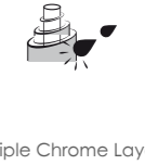
Triple Chrome Layer

The REXSON pumps of the high viscosity range have been designed with robustness in mind, and the aim of offering a high degree of modularity to follow your application. Unlike liquid fluid pumping, the high viscosity range imposes highly variable mechanical stresses from one product to another.