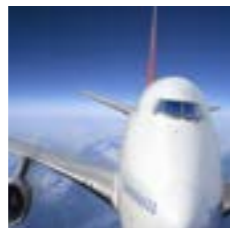
KITCHEN AND BATHROOM